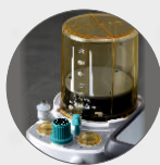
Advanced Breathing System