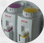
Dual Bracket for Vaporisers